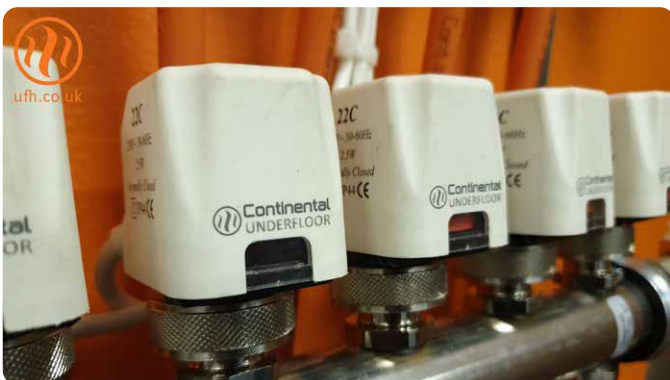
HeatMax™ zone actuators