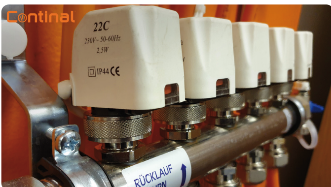
HeatMax™ zone actuators